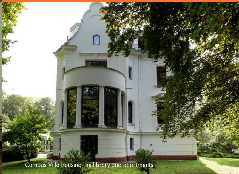
Campus Villa housing the library and apartments